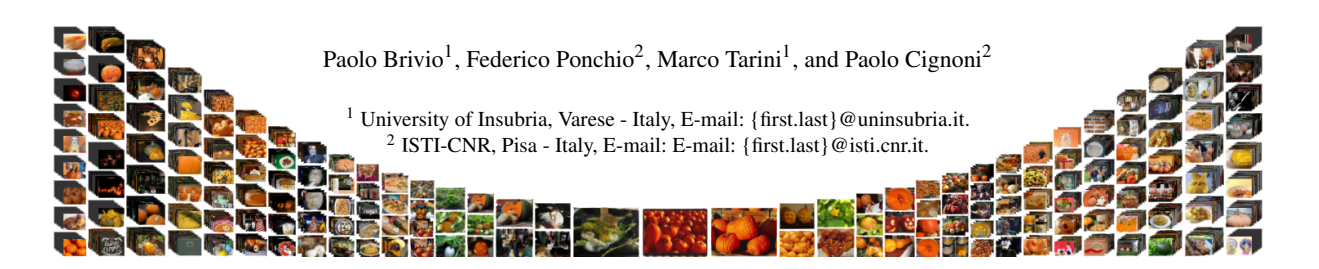
Figure 1: A dataset of a thousand images visualized globally. Near the center, each individual image is visible as a larger thumbnail. At the side, images far from the area of interest are piled together into increasingly taller stacks. As the area of interest changes, the thumbnail bar dynamically rearranges accordingly with a smooth animation.