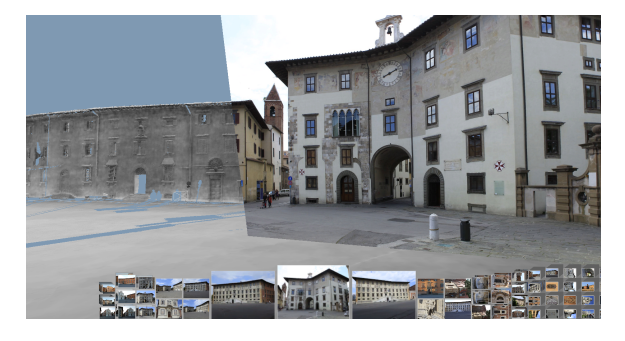
Figure 6: An application using the PileBar (Cavalieri Square dataset). The main area of the screen depicts a 3D scene, navigable in 3D. Selecting a focus image on the bar causes the viewpoint to jump of the corresponding virtual camera.

In Fig. ?? an prototypal application is shown using Pile-Bars [APP NAME REMOVED FOR BLIND REVIEW].