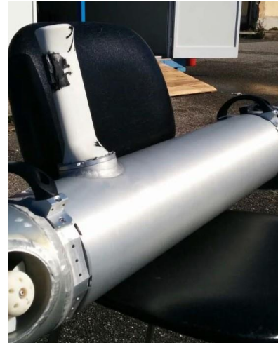
Fig. 7. MARTA watertight stern

battery module there is another thruster one (Fig. 5), before MARTA stern.