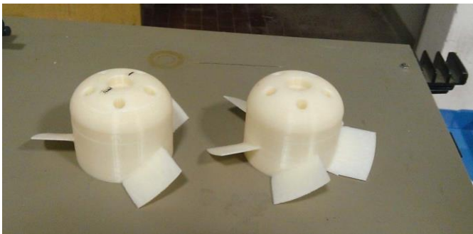
Fig. 6. MARTA thruster propellers

After the bow, there is the first thruster module (Fig. 5). The thruster module houses one lateral and one vertical thruster. As concerns both the main rear propellers and the lateral and vertical thrusters, a “standard” solution consists in making these electrical motors (100 W) watertight, filling in with dielectric oil and connecting them to suitable marine propellers (e.g. plastic propellers printed with the 3D rapid prototyping machine owned by MDM Lab). Since vertical and lateral thrusters are incorporated in the hull of MARTA AUV, the water flow boosted by the propeller is limited and makes impossible to design a proper nozzle in order to maximize the thrust. In these conditions, e.g. a Ka-4-70 propeller (a very common one) would not be efficient: for this reason it has been designed a customized propeller like the one shown in Fig. 6. To determine the optimal propeller geometry, various shapes have been tested, varying the number of blades and the p/d ratio.