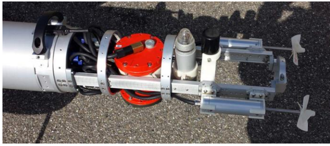
Fig. 8. MARTA wet stern

Finally, MARTA wet stern (Fig. 8) has on board: