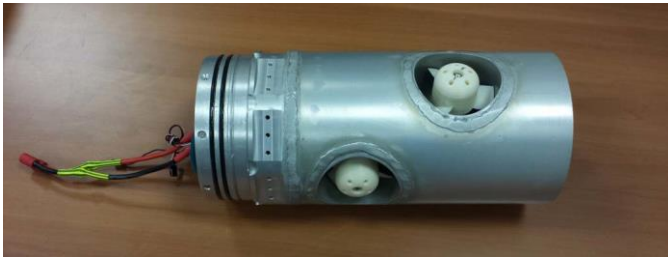
Fig. 5. Thruster module

part the “bow electronics” is placed. Moreover it houses also one of the navigation (vital) computers, ODROID-XU, and the electronic boards of the acoustic modem Evologics 18/34.