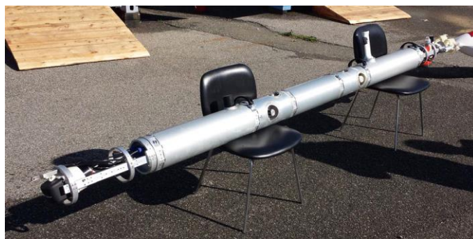
Fig. 3. MARTA AUV prototype

MARTA AUV prototype (Fig. 3) is ready for its first navigation tests at sea.