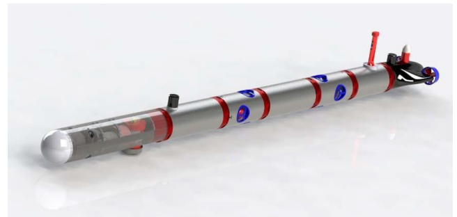
Fig. 1. Final CAD design of MARTA modular AUV

perform. MARTA prototype is deployable from a small boat; the vehicle is modular and has a total length of about 3.5 m (depending on its configuration), an external diameter of 7 inches and an in-air weight of about 80 kg. The vehicle has 5 degrees of freedom fully controllable by means of 6 actuators (electrical motors + propellers): 2 rear propellers, 2 lateral thrusters and 2 vertical thrusters. The propulsion system is redundant: the vehicle is equipped not only with thrusters. The vertical translation and the pitch configuration can be controlled also through two buoyancy modules (placed one in the bow and one in the stern); this way, the vehicle can be controlled even near the seabed, without exploiting the propellers and thus avoiding moving and spreading sand or mud that can create issues for the acquisition of optical and acoustic data. In Fig. 1, the final 3D CAD of MARTA AUV is given.