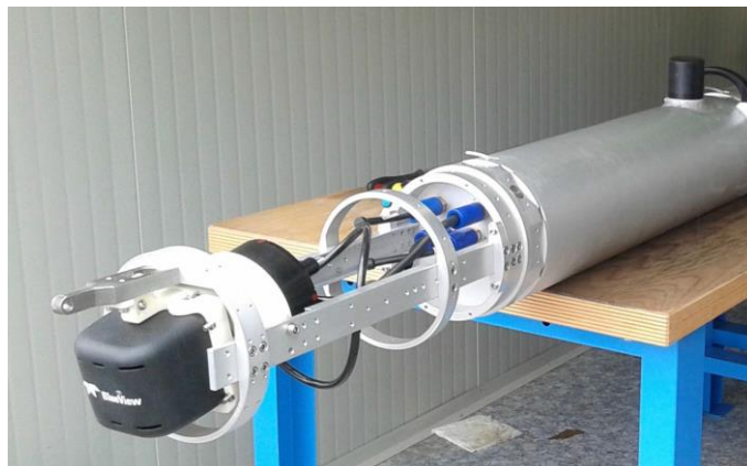
Fig. 4. MARTA bow

Starting from the bow, in Fig. 4 its wet and watertight sections are shown.