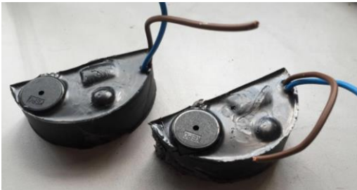
Figure 3: Prototypes encapsulated in the dielectric resin

A dielectric resin epoxy was employed to embed the electronic circuit in order to protect and insulate the components in such a way that the potential hazard in touching the 220 V parts of the circuit during the installation was removed. Figure 3 is the image showing two prototypes encapsulated with the resin. The total cost of the components needed to build the prototype is in the order of 10 euro.