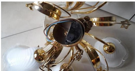
Figure 4: Prototype placed in the ceiling support of the light

The shape of the prototype presented here was designed to be housed inside the ceiling support of a chandelier light (see Figure 4).