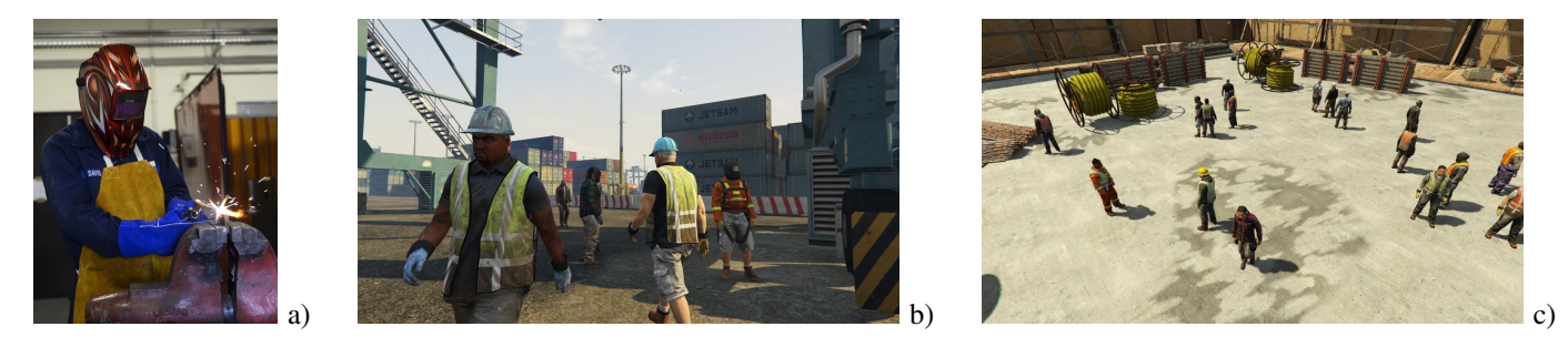
Fig. 1. Examples of safety equipment: a) real photograph of worker wearing a welding mask; b) and c) virtual renderings with people with helmets, high-visibility vests, and welding masks.

few years ago. YOLO architectures [2], [3] and Faster-RCNN [4] are today de facto-standard architectures for the object detection task. They are trained on huge generic annotated datasets, such as ImageNet [5], MS COCO [6], Pascal [7] or OpenImages v4 [8]. These datasets collect an enormous amount of pictures usually taken from the web and they are manually annotated.