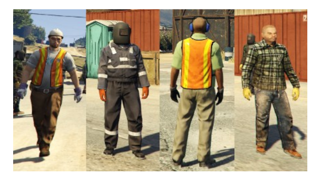
Fig. 3. Examples of safety equipment objects detected by our system.

Dataset annotation is the process which creates the annotated images for the dataset. In our case, we annotate the