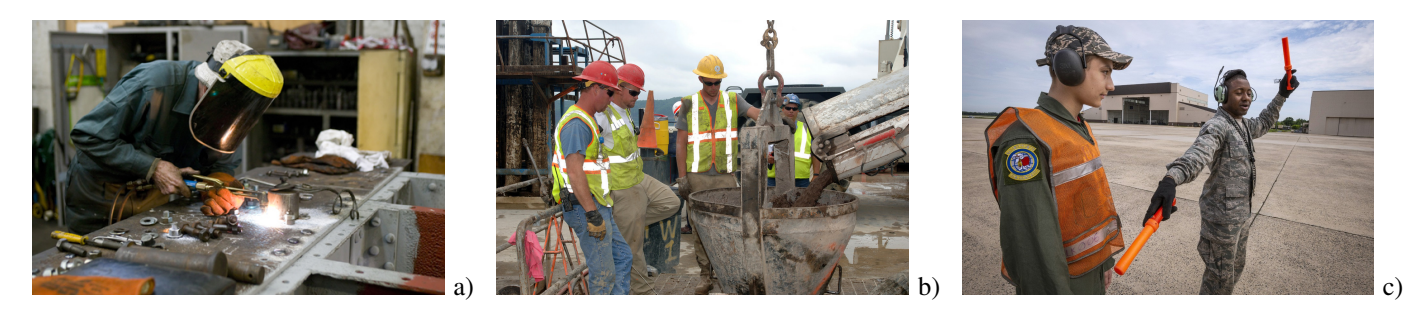
Fig. 5. Real-World Validation Set: composed of 180 copyright-free images, our validation set is available at the project website.