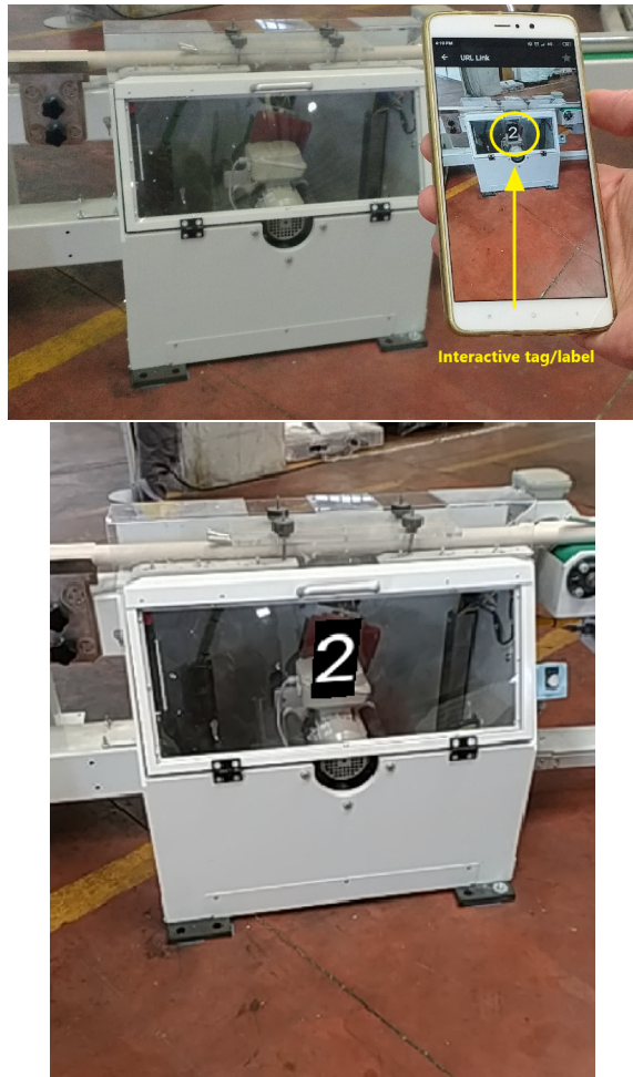
Figure 2: Running prototype application showing an example of augmented reality implemented on a real operating tissue line (cutting blade section). Highlighted in the yellow circle is the interactive label tagged in the real environment (top); a contemporaneous screenshot from the running application (bottom).