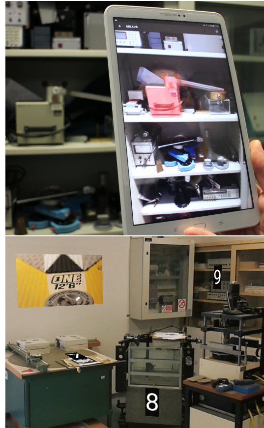
Figure 1: Laboratory environment: (top) an example with a super-imposed interactive object highlighted in red; (bottom) screenshot from the application of another laboratory scenario, with super-imposed interactive objects, a playable video on the top left and numerical tags.

The developed prototype is composed of two main components that are in charge, respectively, to recognize the targets in order to place the AR content and to recover remote data. Target recognition and AR content displacement are entrusted to Wikitude framework through the development of the relative AR scene. The AR scene is built starting from the pictures of the targets, acquired through a simple smartphone, exploiting Wikitude Studio, which is a dedicated program in the Wikitude framework. From the acquired images, a feature point cloud is generated; despite the initial limit of 50 pictures, the point cloud can be extended and refined by uploading further images. Once the point cloud is generated AR objects can be placed directly in a 3D environment relative to the point cloud itself, an example of the laboratory environment reconstruction is shown in Figure 5. Wikitude allows five types of AR content: (i) Images, (ii) Videos, (iii) 3D objects, (iv) Labels and (v) Buttons. The AR scene is then downloaded as an offline application and integrated with the prototype component committed to the remote data recovery; indeed, the downloaded application can be easily modified through a common editor or an IDE such as Android Studio (concerning AR Android application). Aiming at further enriching the AR experience and providing interactive functionalities, AR content is addressed, exploiting its unique ID given by the framework, and edited adequately on the basis of