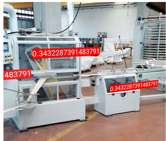
Figure 4: Sample of the application while showing real-time dynamic values (e.g. rpm values of the working engine) as AR objects.

the target. In addition, the size of the point cloud file generated by Wikitude is listed. The efficiency measures how many times the target is recognized by the application (i.e. recognizedTargets ). The recognition has to occur within a predefined slot of time, which for the experimentation is fixed as 1sec. The number of recognition attempts (i.e. totalAttempts ) is the same for all the experiments. Efficiency is computed as: Ef = \text{recognizedTargets} / \text{totalAttempts} .