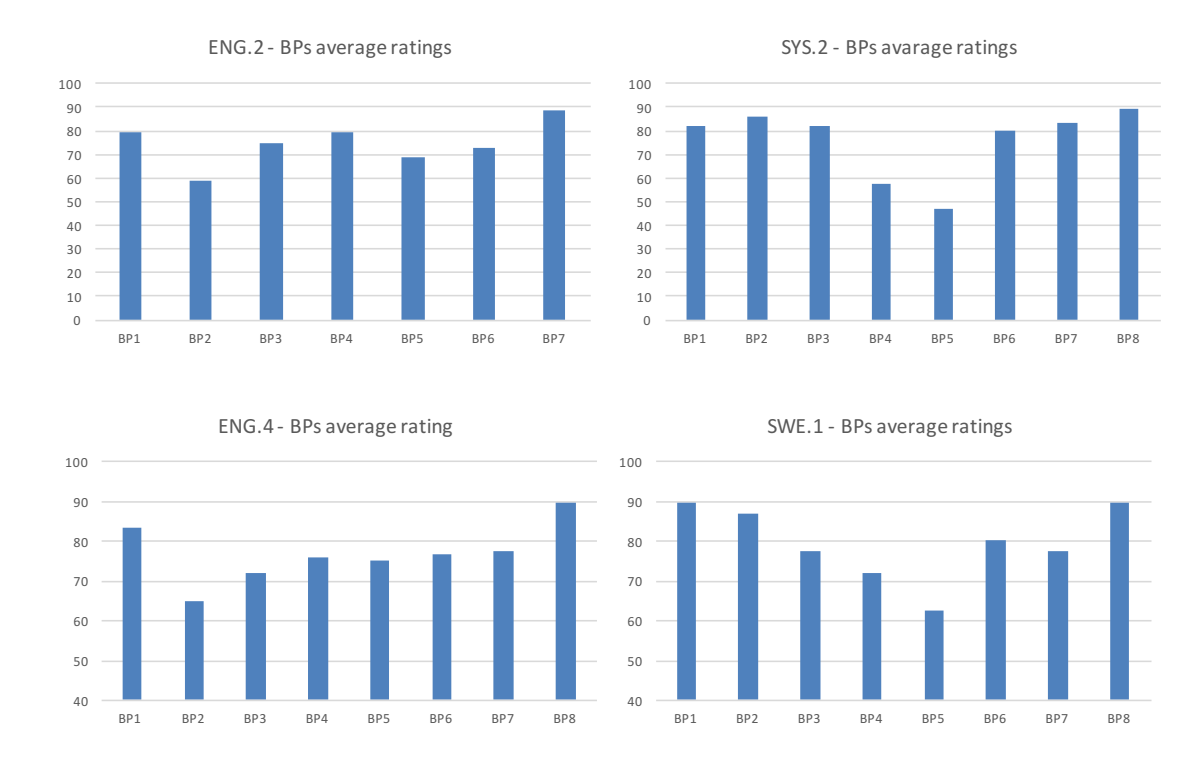
Figure 2: Average Rating of Single Base Practices

According to this assumption, it is possible to calculate the average value of the ratings of each BP in the sample of this study. The average values are represented in graphical format in Figure 2.