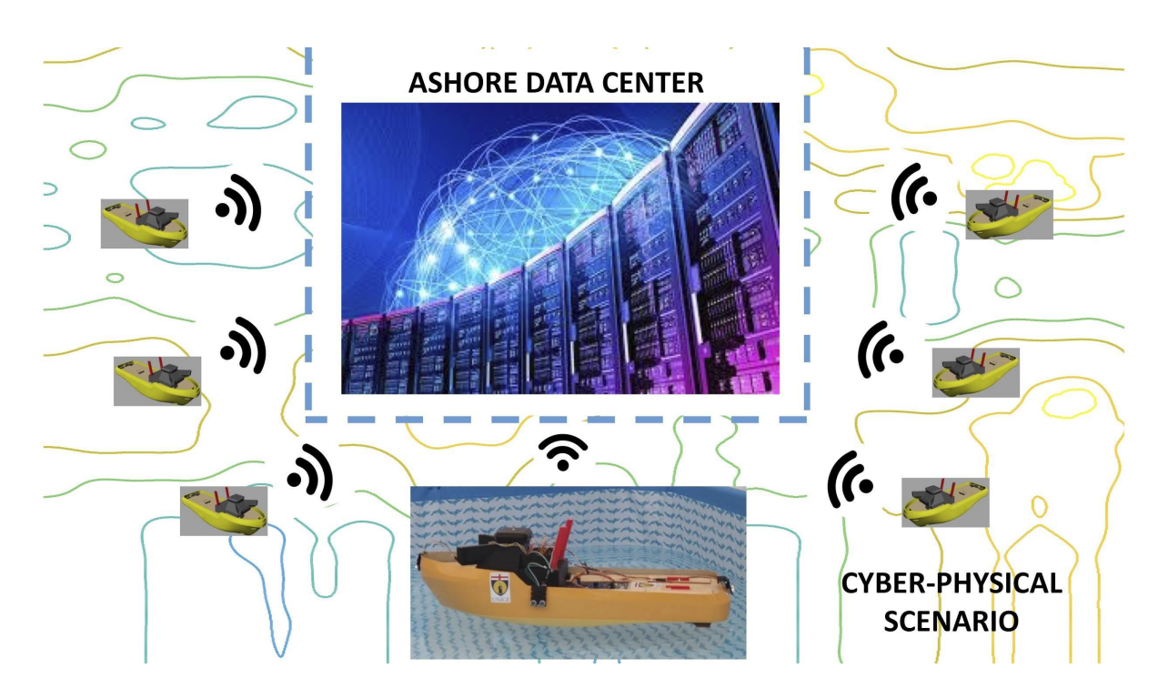
Figure 3: Cyber-physical integration for testing.