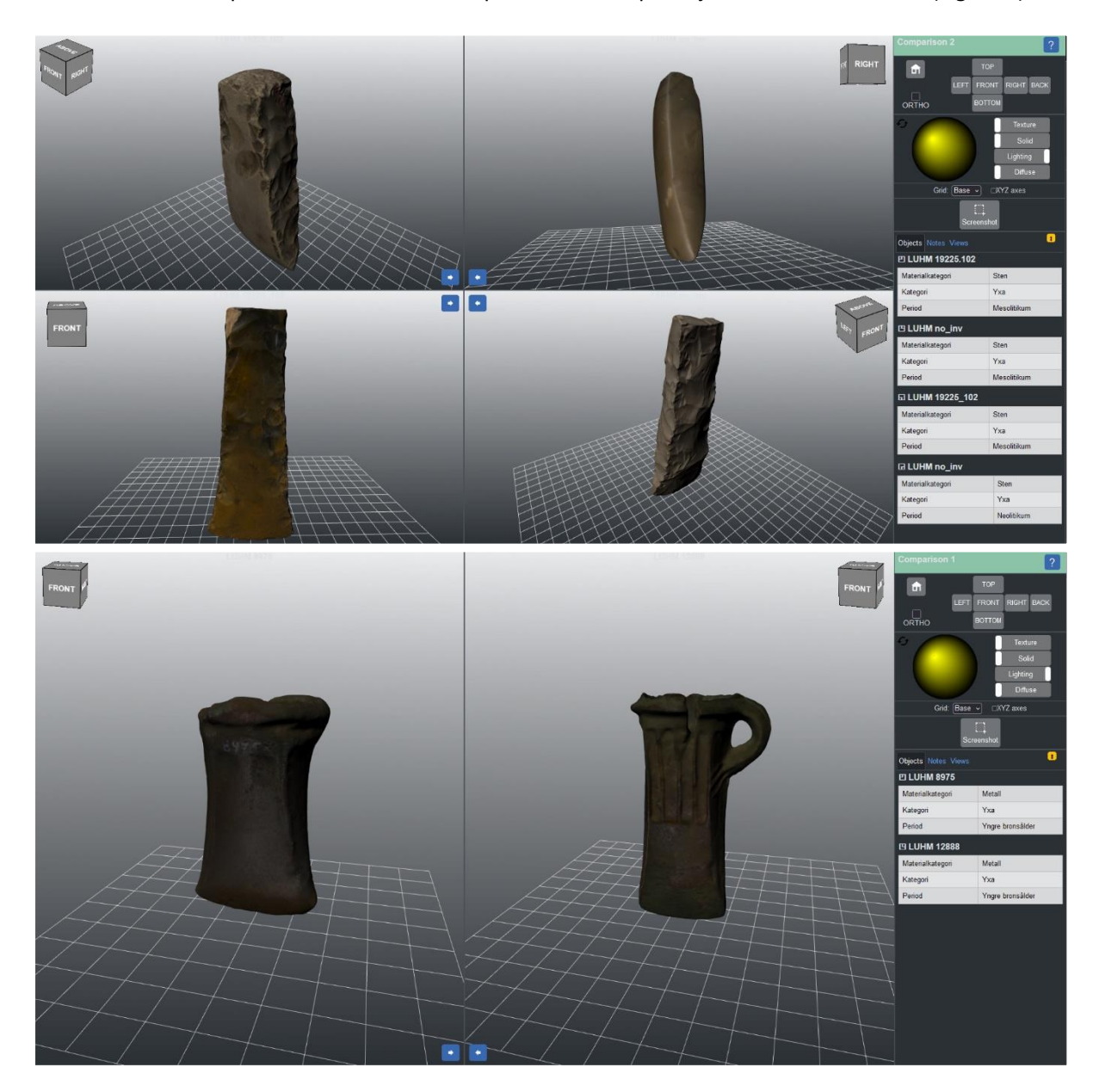
Figure 3 - The new "comparison" entity in the collection can be used to create side-by-side multiobject visualisation and annotation.

The collection should not be just a set of objects with some attached annotations but should contain other user-created elements representing cross-object relationships and reasoning. A development direction is to design and implement more ways to manipulate and combine the objects in a collection, providing the user with more ways of working with the available entities. The first of these new tools being added to the online platform is the direct comparison of multiple objects inside a collection (Figure 3).