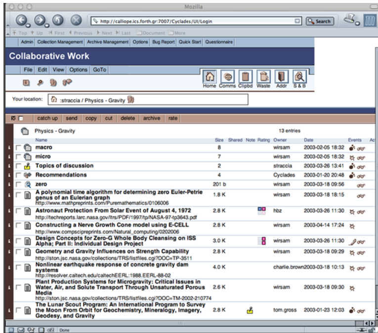
Figure 2: User interface: folder content

The Search and Browse Environment supports the activity of searching records in the various collections accessible from within CYCLADES as well as to search into the shared folders or private folders a user owns. Users can issue a query and are allowed to store selected records within their folders and community folders they have access to. Essentially, three types of search are supported: (i) in ad-hoc search a user specifies a query and the system looks for relevant records within a specified collection; (ii) filtered search is like the usual ad-hoc search, except that the user specifies, additionally to a query (e.g. 'zero'), also a target folder (e.g. 'Physics-Gravity'). The goal of the system consist then to find documents not only relevant to the query, but also relevant to the topic of the target folder (in our example, the request is something like 'find records about zero gravity'); and (iii) in what's new, on-demand , the user specifies a target folder, without specifying a query, and the goal of the system consists in finding all records, relevant to the target folder, which where become available to the system since the last time the user asked for this request. This corresponds roughly to the functionality provided by alerting services, except that the profile is build implicitly from the folder content, and that records are delivered to the user on-demand. The recommendation environment provides the off-line version.