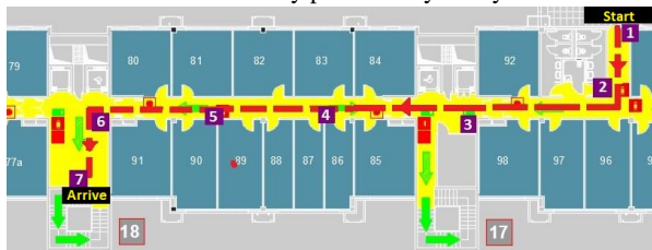
Figure 4: The path considered in the test.

At the end of this preliminary evaluation only two prototypes were considered suitable (the two bracelets and the one bracelet), while the others were discarded. To understand the effectiveness of the two prototypes, we conducted a user test in the same research centre with 36 new subjects (15 females) of average age 42.94 years (ranging from 24 to 70) and SD=12.46 . Twelve users had a PhD, 12 users had a master degree, 4 users had a bachelor's degree, and 8 users had a high school diploma. In the final test, we considered just flat environments (e.g. no multi floor buildings), and indications were automatically provided by the system.