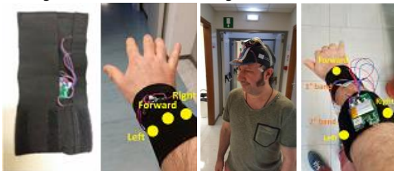
Figure 3: (a, b) Bracelet; (c) Cap; (d) Two band bracelet.

A configuration was also envisioned in which four actuators are positioned on the top, bottom and sides of the wrist (Figure 3a, 3b), so a vibration on the top, left, right or bottom side of the wrist indicates go forward, turn left, turn right or turn back.