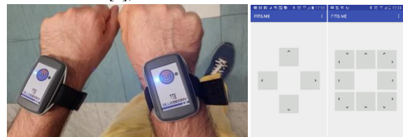
Figure 1: (a) The two bracelets; the smartphone applications: (b) 4 directions; (c) 8 directions.

Each bracelet (Figure 1a) contains one vibrating motor Parallax 9000 RPM 3VDC [5], 1 cm in diameter x 0.27cm thickness.