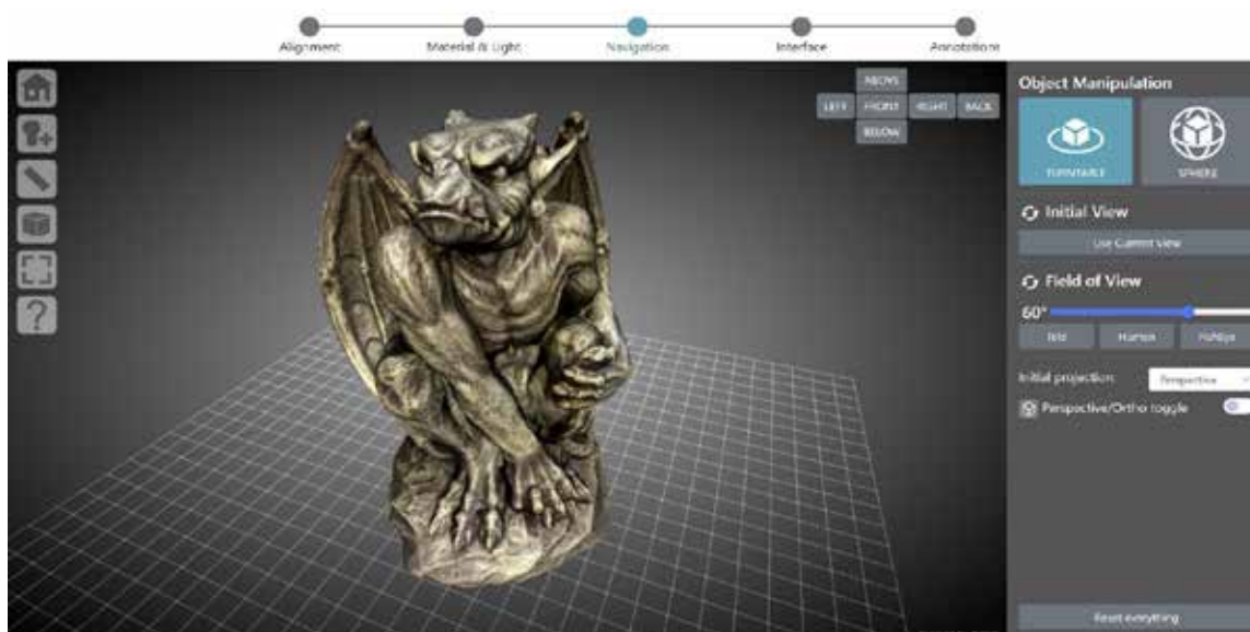
Figure 2. Step-by-step configuration wizard assisting the setup of the web presentations of 3D content in the Visual Media Service

Also, in this case, we explored the research space, thanks to the development of the Visual Media Service 6 , in the context of the ARIADNE European project 7 . The Visual Media Service is a platform for creating a web presentation starting from different complex media such as 3D, RTI and highresolution images. It has not been designed to be a repository, but to give the cultural heritage audience the possibility to experiment with web publishing by playing with some lower-level libraries exposed in a shared environment with simple web interfaces ( Figure 2 ).